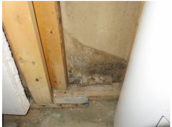
Figure 24 Mold in Basement Furnace Room