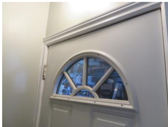
Figure 28 Entry Door(s) Not Fire-Resistant

NOTE: Any areas obstructed at the time of inspection should be cleared and checked prior to closing. The integrity of the fire-separation wall/ceiling assemblies generally required between the house and garage, including any house-to-garage doors and attic hatches, must be maintained for proper protection. Review manufacturer use and safety instructions for garage doors and automatic door operators. All doors and door operators should be tested and serviced on a regular basis to prevent personal injury or equipment damage. Any malfunctioning doors or door operators should be repaired prior to using. Door operators without auto-reverse capabilities should be repaired or upgraded for safety. The storage of combustibles in a garage creates a potential hazard, including the possible ignition of vapours, and should be restricted.