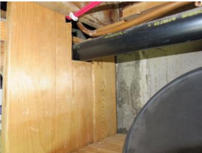
Figure 15 Repaired Crack at SW Wall(s)