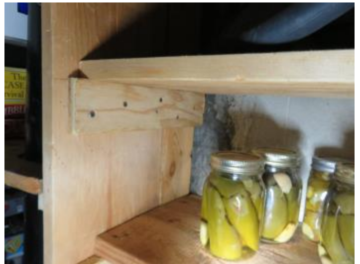
Figure 16 Repaired Crack at SW Wall(s)