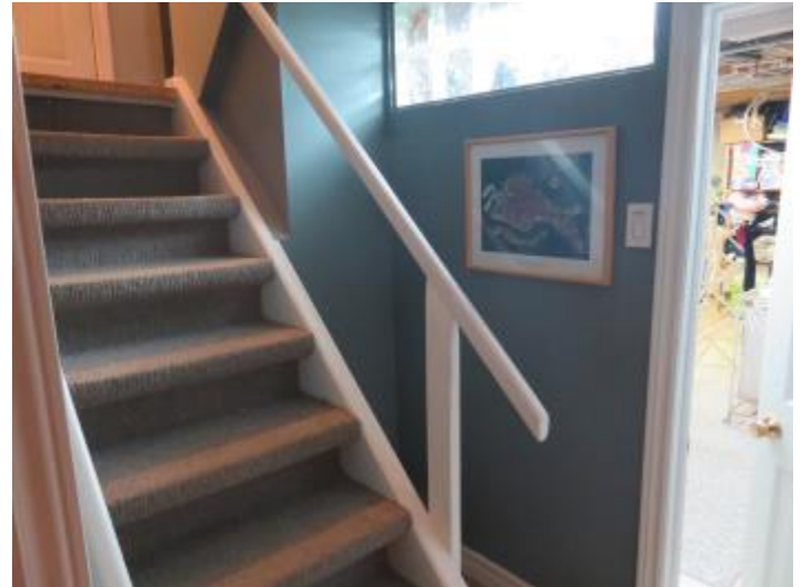
Figure 26 Basement Handrail(s) Missing Baluster(s)

NOTE: All homes are subject to indoor air quality concerns due to factors such as venting system defects, outgassing from construction materials, smoking, and the use of house and personal care products. Air quality can also be adversely affected by the growth of molds, fungi and other micro-organisms as a result of leakage or high humidity conditions. If water leakage or moisture-related problems exist, potentially harmful contaminants may be present. A home inspection does not include assessment of potential health or environmental contaminants or allergens. For air quality evaluations, a qualified testing firm should be contacted. All homes experience some form of settlement due to construction practices, materials used, and other factors. A pre-closing check of all windows, doors, and rooms when house is clear of furnishings, drapes, etc. is recommended. If the type of flooring or other finish materials that may be covered by finished surfaces or other items is a concern, conditions should be confirmed before closing. Lead-based paint may have been used in the painting of older homes. Chimney and fireplace flue inspections should be performed by a qualified specialist. Regular cleaning is recommended. An assessment should be made of the need for and placement of detectors. All smoke and carbon monoxide detectors should be tested on a regular basis.