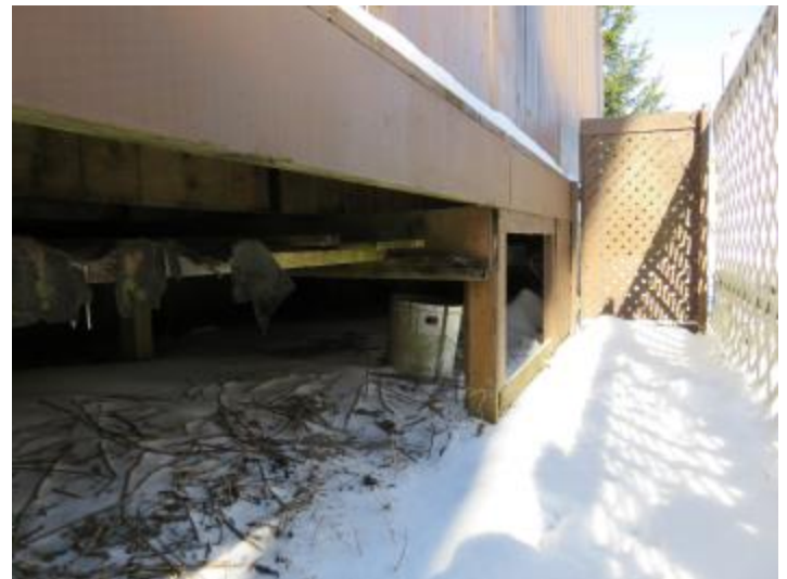
Figure 4 NE Deck Substandard Construction