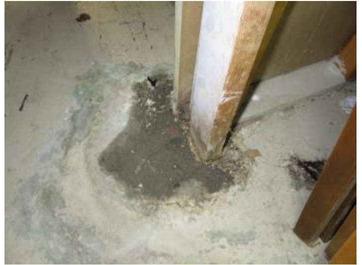
Figure 12 Evidence of Moisture Intrusion at SW Wall(s)