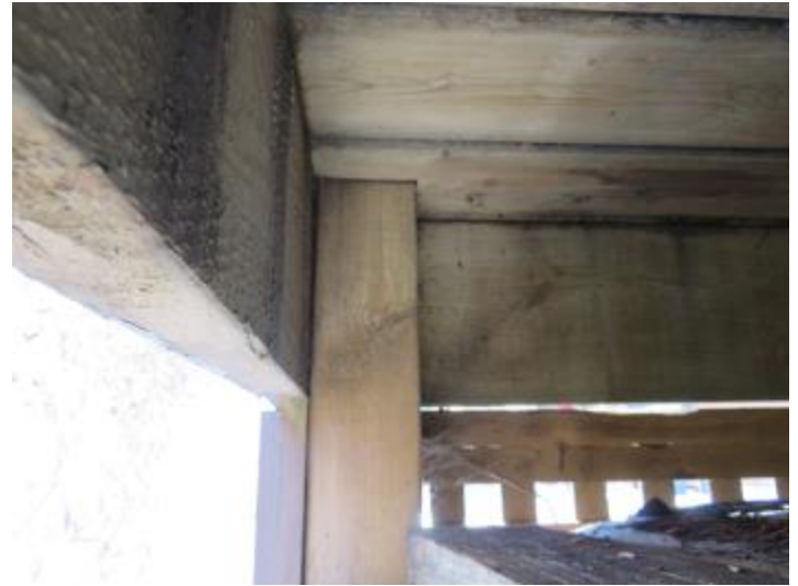
Figure 2 NE Deck Substandard Construction