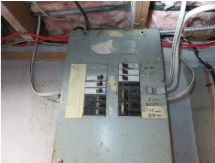
Figure 19 Sub-Panel Legend(s) Substandard