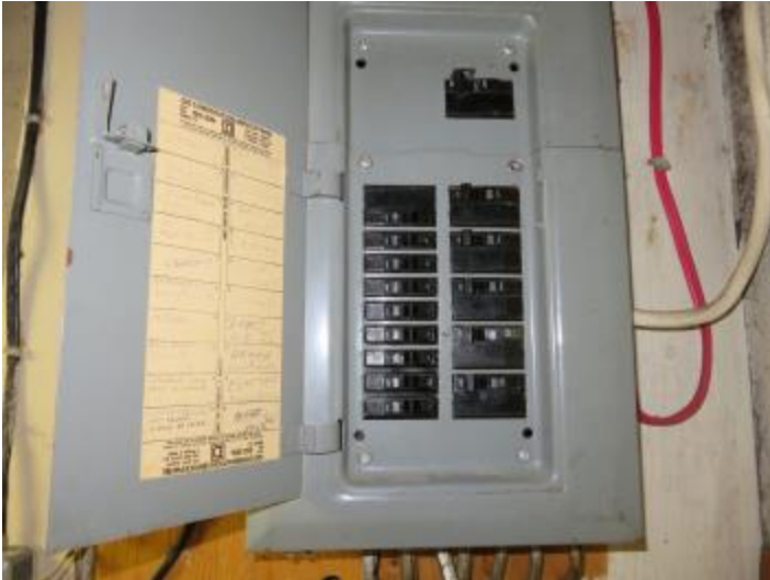
Figure 17 Main Panel Legend(s) Substandard