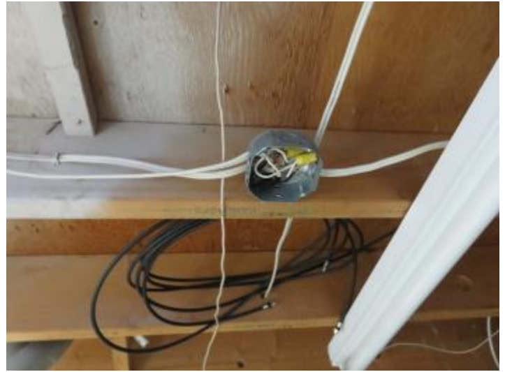
Figure 22 Laundry Room Junction Box Missing Cover

NOTE: Older electric service may be minimally sufficient or inadequate for present/future needs. Service line clearance from trees and other objects must be maintained to minimize the chance of storm damage and service disruption. The identification of inherent electric panel defects or latent conditions is not possible. It is generally recommended that aluminum-wiring systems be checked by an electrician to confirm acceptability of all connections and to determine if any remedial measures are required. GFCIs are recommended for all high hazard areas (e.g., kitchens, bathrooms, garages and exteriors). AFCIs are relatively new devices now required on certain circuits in new homes. Consideration should be given to adding these devices in existing homes. Regular testing of GFCIs and AFCIs is recommended. Recommend tracing and labeling of all circuits, or confirm current labeling is correct. Any electric defects or capacity or distribution concerns should be evaluated and/or corrected by a licensed electrician.