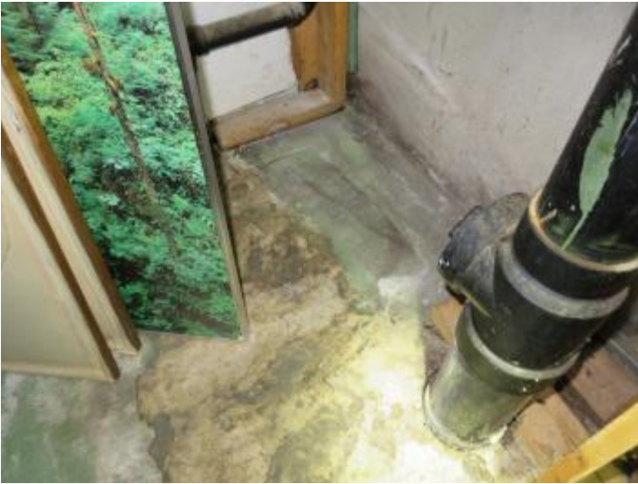
Figure 11 Evidence of Moisture Intrusion at SW Wall(s)