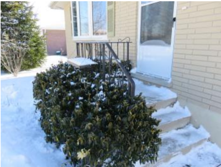
Figure 7 Front Porch Handrail(s)/Guard(s) Loose