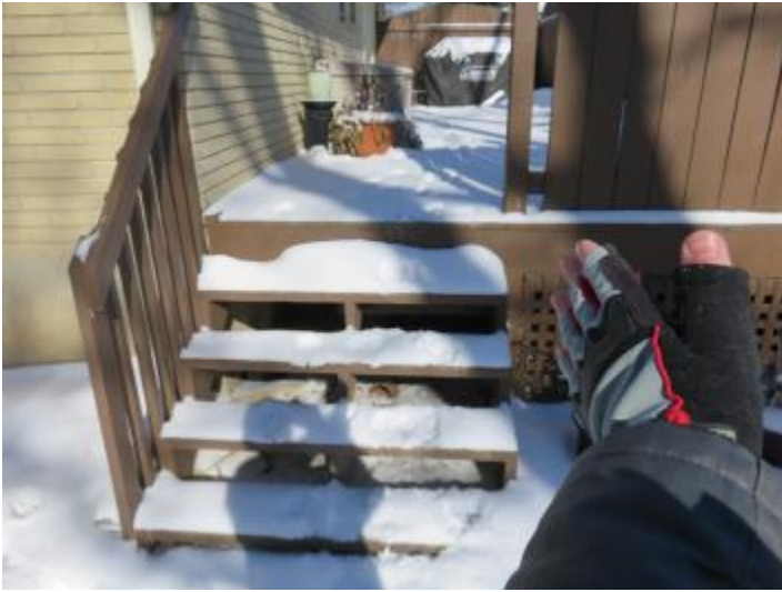
Figure 5 NE Deck Step(s) Missing Handrail