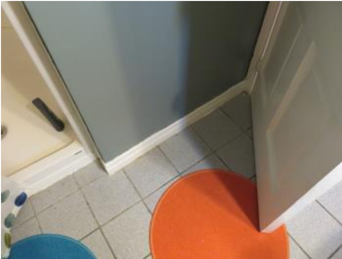
Figure 25 Water Damage in Basement Bathroom