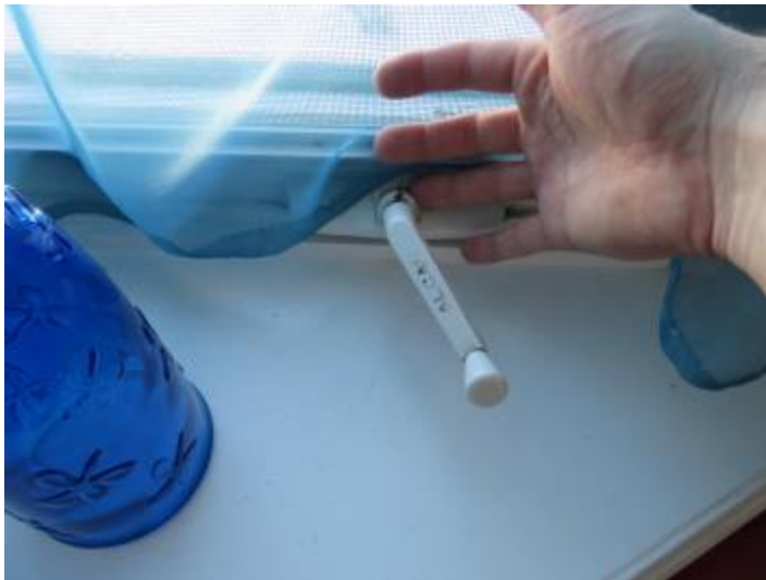
Figure 23 Crank Handle(s) Broken at Front Window(s)