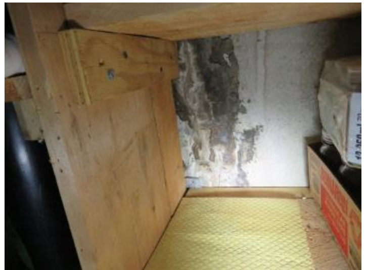
Figure 14 Repaired Crack at SW Wall(s)