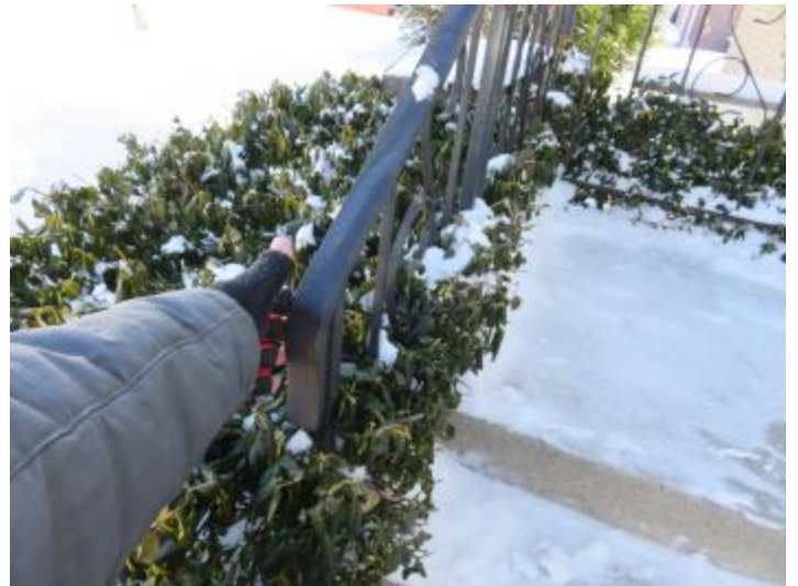
Figure 8 Front Porch Handrail(s)/Guard(s) Loose

NOTE: Conditions of the grounds are subject to sudden change with exposure to rain, wind, temperature changes, and other climatic factors. Roof drainage systems and site/foundation grading and drainage must be maintained to provide adequate water control. Improper/inadequate grading or drainage and other soil/site factors can cause or contribute to foundation movement or failure, water infiltration into the house interior, and/or mold concerns. Independent evaluation by an engineer or soils specialist is required to evaluate geological or soil-related concerns. Houses built on expansive clays or uncompacted fill, on hillsides, along bodies of water, or in low-lying areas are especially prone to structural concerns. All improved surfaces such as patios, walks, and driveways must also be maintained to drain water away from the foundation. Any reported or subsequently occurring deficiencies must be investigated and corrected to prevent recurring or escalating problems. Independent evaluation of ancillary and site elements by qualified service companies is recommended prior to closing.