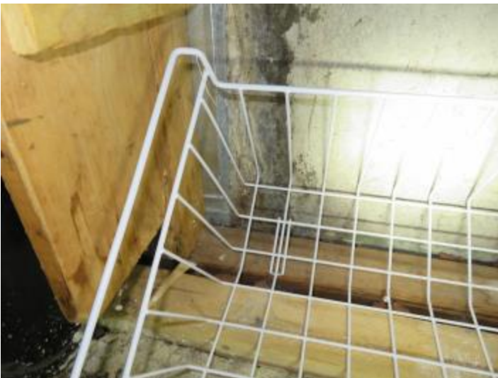
Figure 13 Repaired Crack at SW Wall(s)