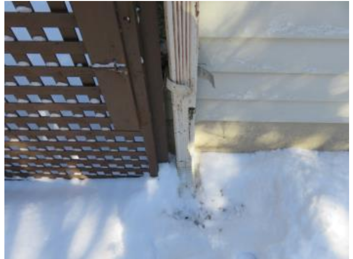
Figure 9 NW Downspout Discharging onto Walkway(s) Figure 10 SW Downspout Missing Extension

NOTE: Not the entire underside of the roof sheathing was inspected for evidence of leaks. All roofs have a finite life and will require replacement at some point. In the interim, the seals at all roof penetrations and flashings, and the water tightness of rooftop elements, should be checked periodically and repaired or maintained as required. Any roof defect can result in leakage, mold, and subsequent damage. Conditions such as hail damage or manufacturing defects or whether the proper nailing methods or underlayment were used are not readily detectible during a home inspection. Gutters (eaves troughs) and downspouts (leaders) will require regular cleaning and maintenance. All chimneys and vents should be checked periodically. In general, fascia and soffit areas are not readily accessible for inspection; these components are prone to decay, insect, and pest damage, particularly with roof or gutter leakage. If any roof deficiencies are reported, a qualified roofer or the appropriate specialist should be contacted to determine what remedial action is required. If the roof inspection was restricted or limited due to roof height, weather conditions, or other factors, arrangements should be made to have the roof inspected by a qualified roofer, particularly if the roofing is older or its age is unknown. Evidence of prior leaks may have been disguised by interior finishes.