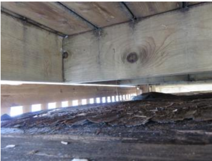
Figure 3 NE Deck Substandard Construction