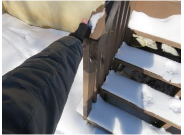
Figure 6 NE Deck Step(s) Handrail Missing Post