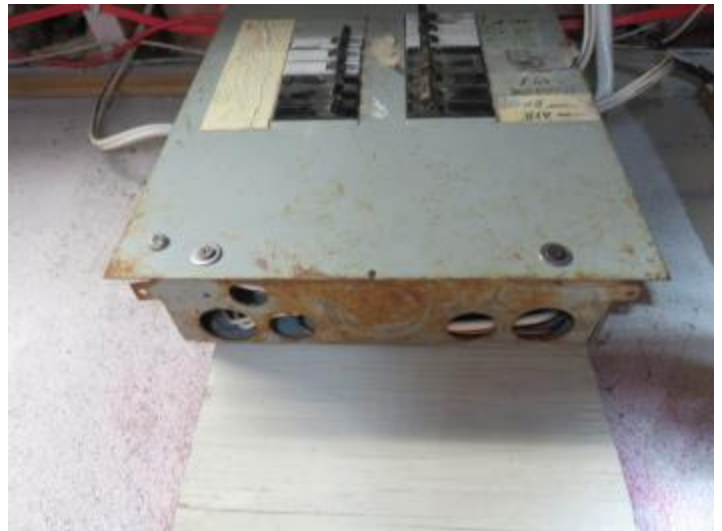
Figure 20 Sub-Panel Missing Knockout(s)