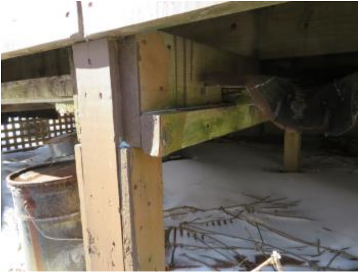
Figure 1 NE Deck Substandard Construction