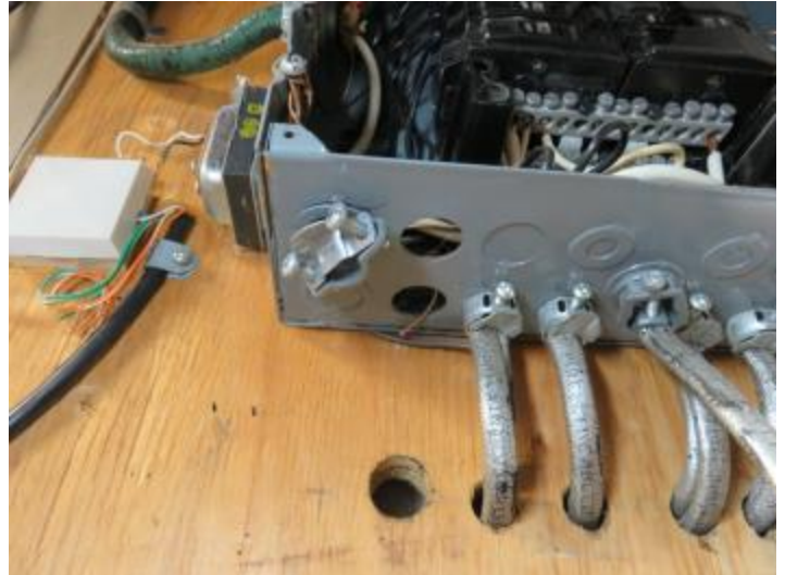
Figure 18 Main Panel Missing Knockout(s)